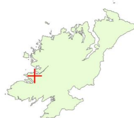
Co. Dhún na nGall Co. Donegal